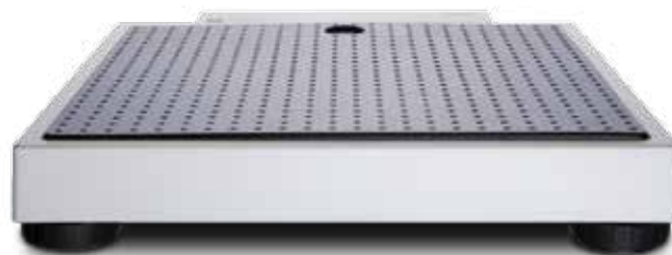
The flat design and slip-proof surface ensure easy access and a secure stance.